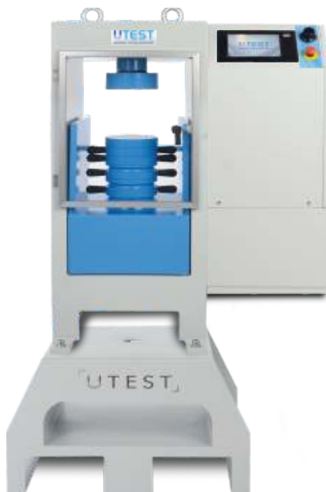
UTC - 4722.FPR