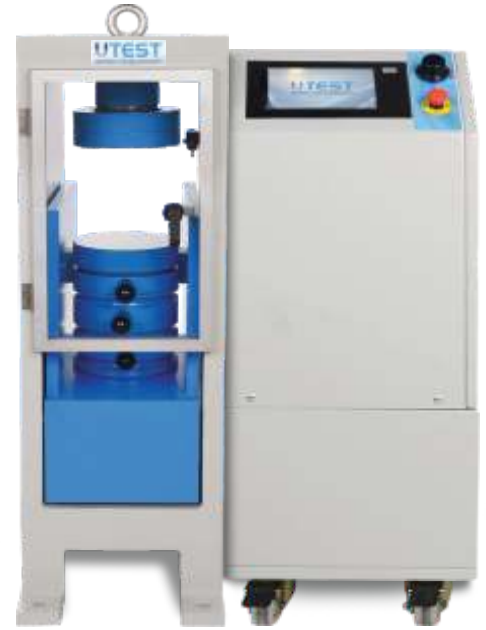
UTC - 4702.FPR