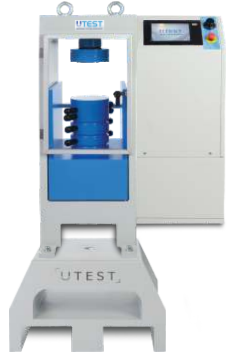
UTC-4712.FPR or UTC-4680

The advantages of performing tests on computer with using UTEST Software, such as reporting, graphical output, etc. can be seen in detail at the pages of UTEST Software for Automatic Compression / Flexure Testing Machines.