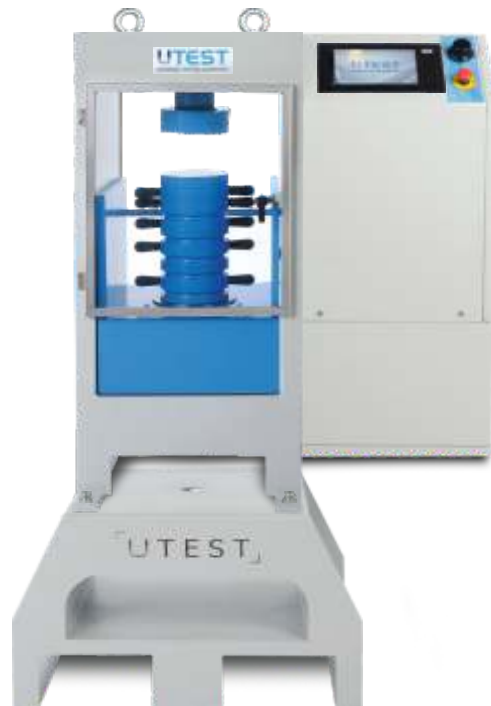
UTC - 4732.FPR