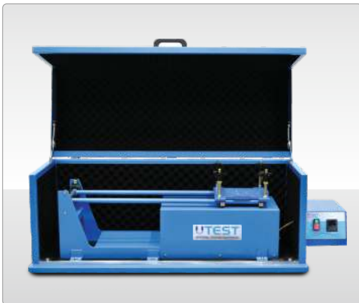
UTCM-0891 Jolting Table with Soundproof Safety Cabinet